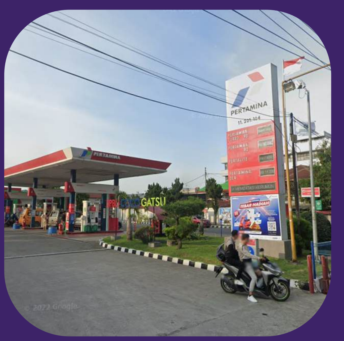
34 Province National, Indonesia